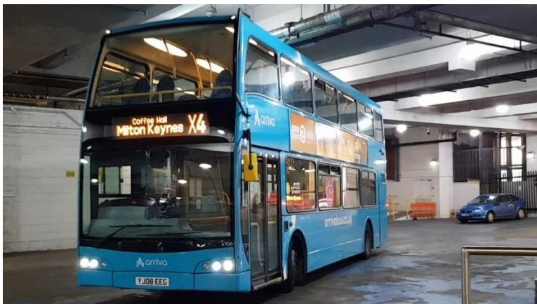
Bus Services Changes impacting

Whilst the above length of road is closed the alternative route will be via Standing Way and Grafton Street (and vice versa)