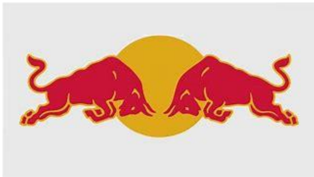
Red Bull Statue

Colleagues may recall the theft of numerous trophies from the Red Bull reception area at Stewart House – and the recovery of said trophies from a lake at a golf course some days later.